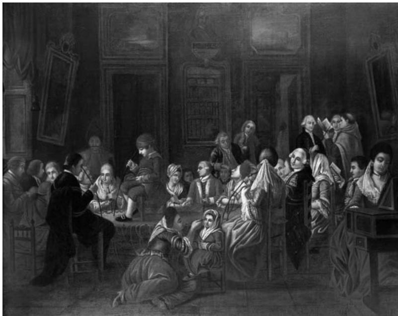
Fig. 1 A group of mesmerised French patients (1778/1784) have their treatment enhanced by the playing of a harpsichord and the singing of a monk.

and opened up the possibility of mental ‘contagion’ through music at a time when it was widely felt that emerging mass society threatened both individuality and order.